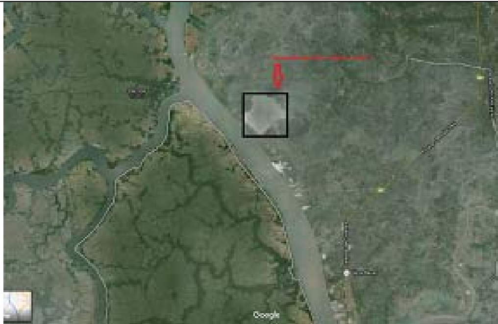
LOCATION MAP:2X660MW MAITREE RAMPAL PROJECT